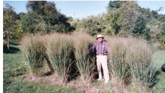
Switchgrass 'Northwind' Plot in Illinois.