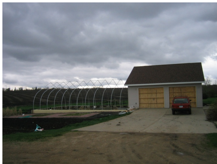
Greenhouse prior to final completion.