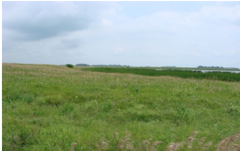
Native Prairie in southwest MN.