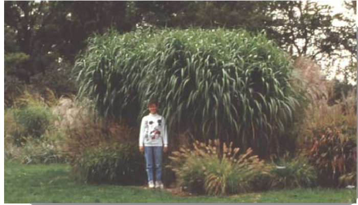
Miscanthus x giganteus [center] at the Minnesota Landscape Arboretum